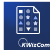
KWizCom KPI Column from KWizCom App Details