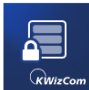
KWizCom Dynamic Column Permissions from KWizCom App Details