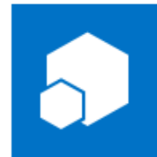
KWizCom EasyQuiz App Details

After you have added the app, it will install onto that site and become available for use.